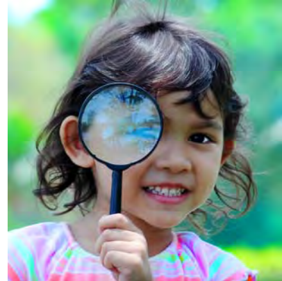
WHAT DO YOU SEE?