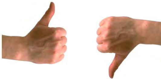
YES OR NO