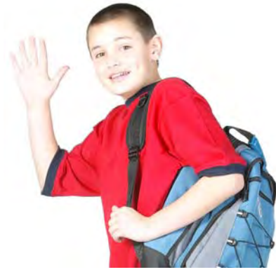
WHAT'S THE WORD?