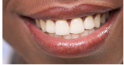
MOVE YOUR MOUTH