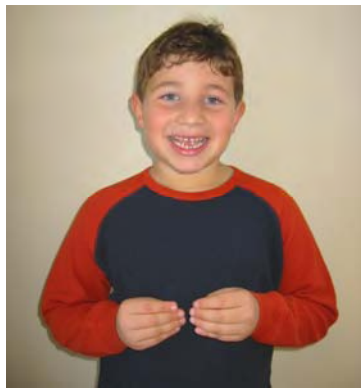
WHEN I WANT