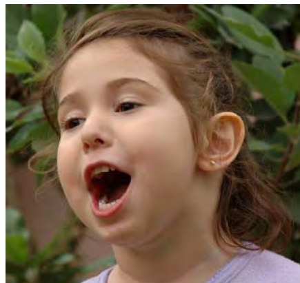
THE SILLIEST SONG